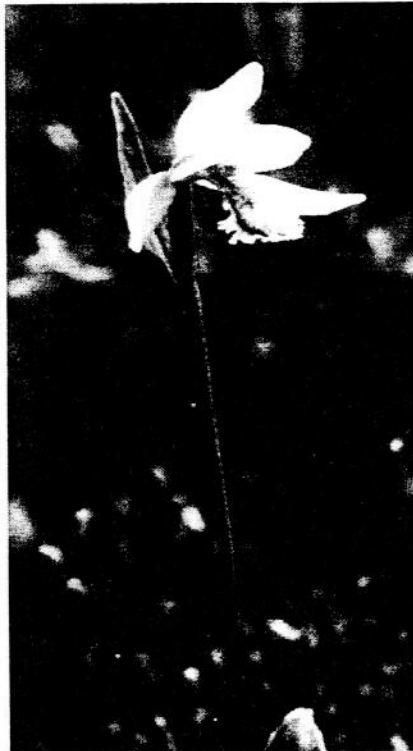
Rose Pogonia ( Pogonia ophioglossoides )